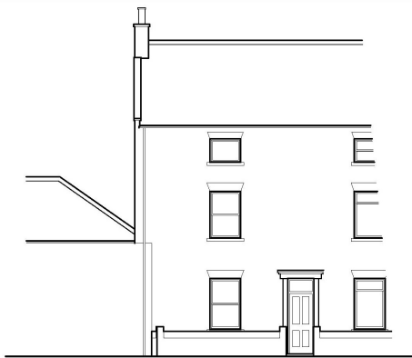
Commercial St - North 1:100